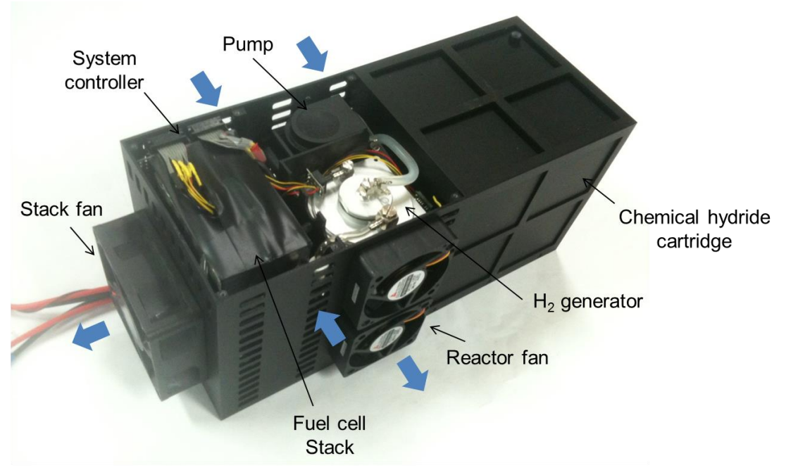
Fig. 2 Prototype of a compact chemical hydride fuel cell system